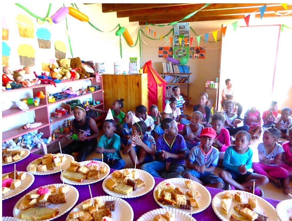
Celebrating the opening of the new building