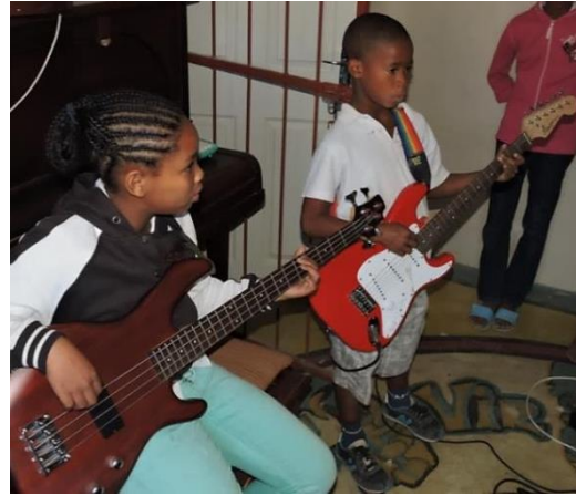
Newcomers to the Music Programme