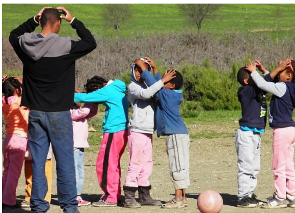
Interns running the Vleiplaas Holiday School