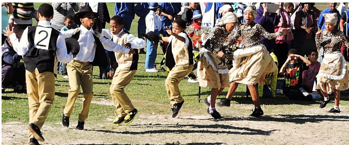
The senior Net vir Pret group entertains the crowds.

We greatly appreciated the support of the Mayor who contributed towards the expense of the costumes.