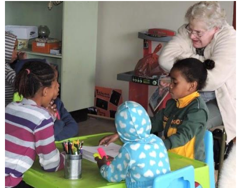
Leslie Howard story-telling

children and we hope she'll come back soon.